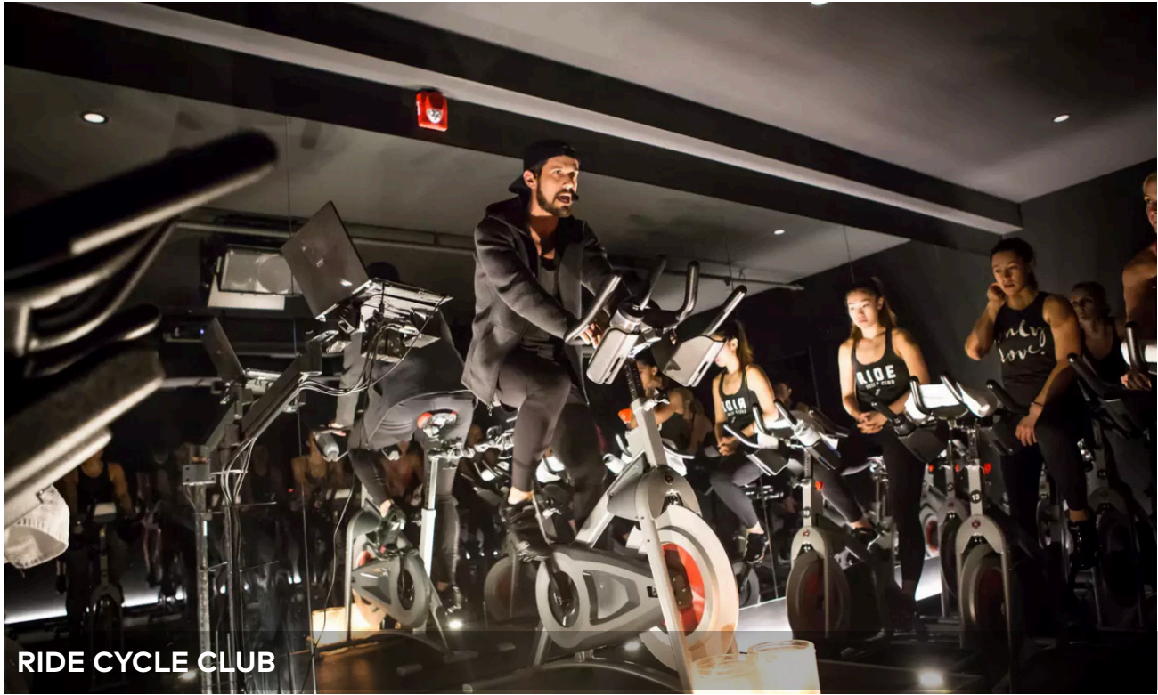
RIDE CYCLE CLUB