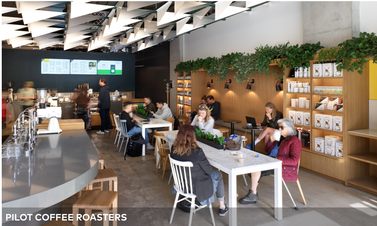
PILOT COFFEE ROASTERS